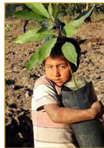
Student carrying avocado sapling