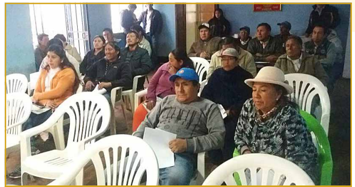
Members of the community attend environmental talk

❖ We firmly believe in protecting the health, safety and well-being of the Eloro family and the local communities involved