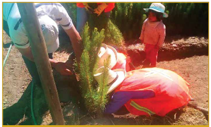
Women of the Pallasca community working at the greenhouse

❖ In Pallasca our tasks are carried out in a strategic way, in order to achieve a better understanding between the community and the company