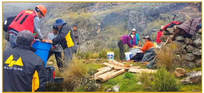
Delivery of materials for the trout farm

An unfinished infrastructure that holds a capacity of 30 thousand trout but due to its poor management only had 3 thousand, was reason enough for Eloro to want to contribute. The accompanying pictures showcase the team delivering trout food, materials and accessories for the fish farm in Pallasca.