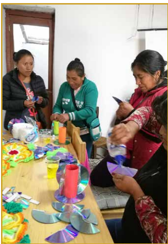
Arts and crafts in Pallasca

In addition to the knitting workshops, environmental talks have been held with the participants, as it is very important to educate the community on the impacts mining activities may cause to the environment.