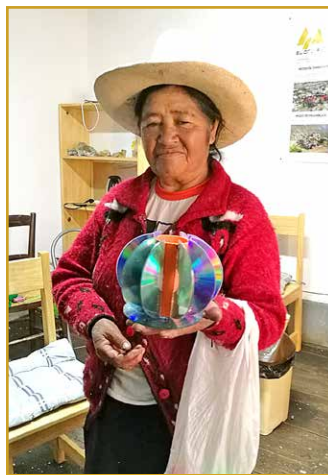
Pencil holder made by Pallasca woman