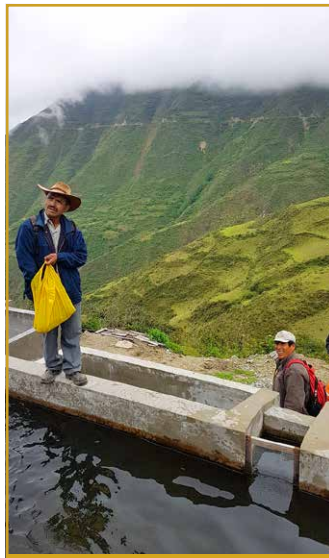
Trout farm in Pallasca

An unfinished infrastructure that holds a capacity of 30 thousand trout but due to its poor management only had 3 thousand, was reason enough for Eloro to want to contribute. The accompanying pictures showcase the team delivering trout food, materials and accessories for the fish farm in Pallasca.