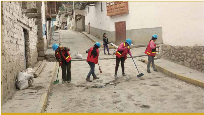
Cleaning of the streets in Pallasca

A support program for the betterment of the community has been developed both in Pallasca and Huandoval. One of the activities that took place recently was the cleaning of the streets in the town. Women from both locations participated in the socially conscious event.