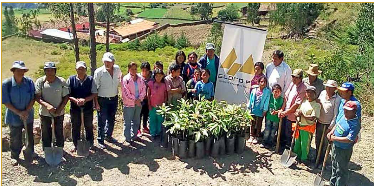
Offering of avocado saplings to the representative of the education centre at Culcubamba

❖ The seedlings were donated by Eoro and the gratitude showed by the population made the contribution a complete success